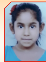
Gungun Std I 91% (SDVB)