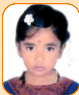
Sanskruti Std I 88% (RKSVM)