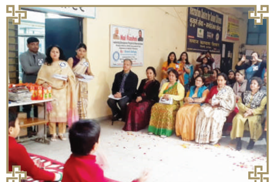
Members enjoying the Cultural Program