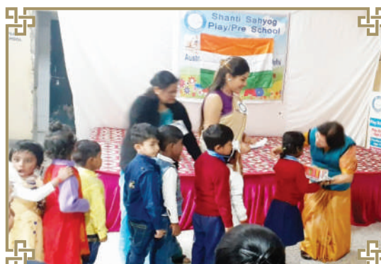
Guests distributing gifts to children