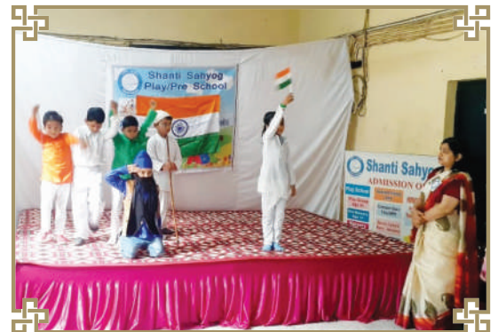
Skit on National Integration & Religious Harmony