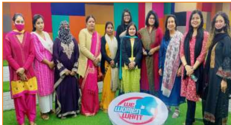
United Against Gender based Violence