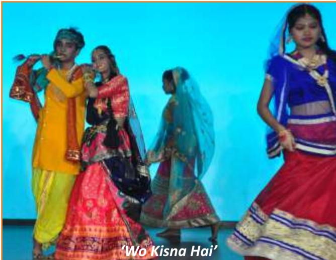
'Wo Kisna Hai'