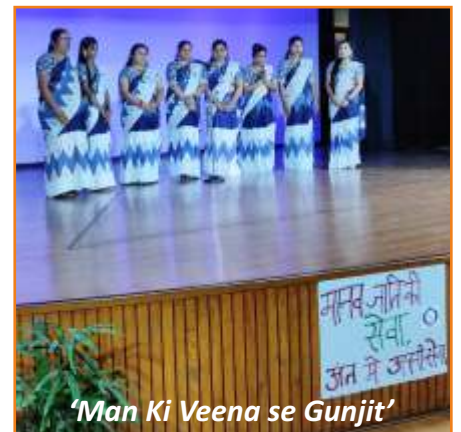
'Man Ki Veena se Gunjit'