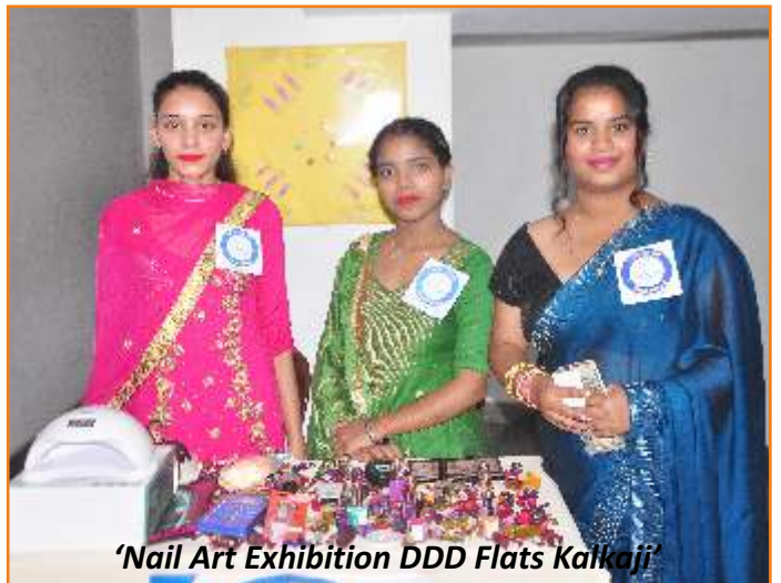
'Nail Art Exhibition DDD Flats Kalkaji'