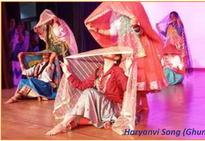
Haryanvi Song (Ghungroo tod ke Manegi)