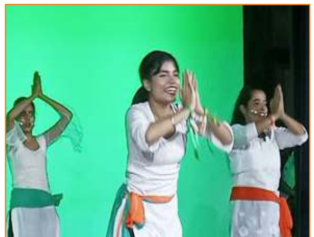
'Ye Desh Hai Veer Jawano Ka'