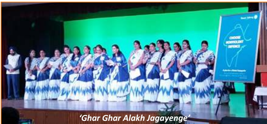
'Ghar Ghar Alakh Jagayenge'