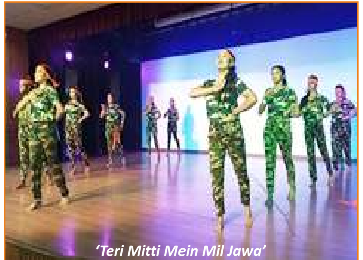
'Teri Mitti Mein Mil Jawa'