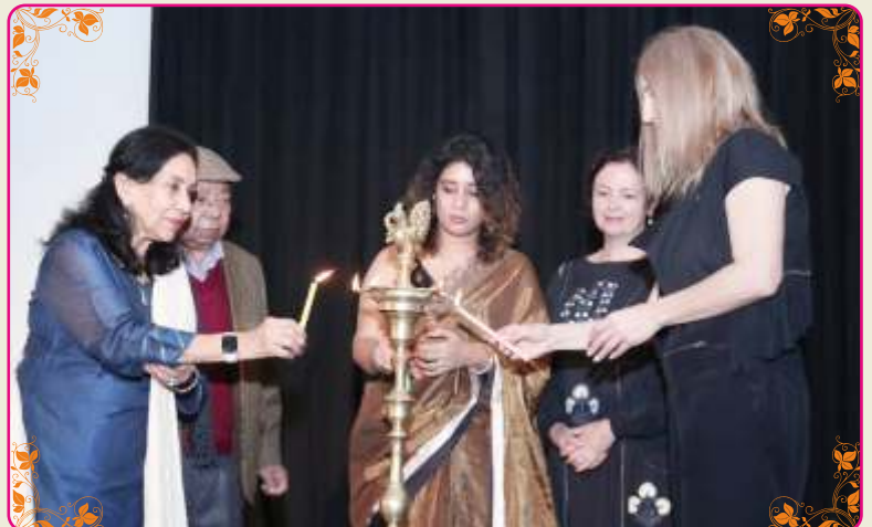
Guests of Honour lighting the Lamp