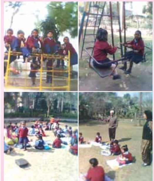
Play/Pre School children having a gala time !