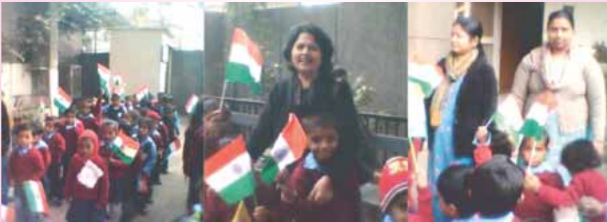
Play/Pre School children line up for celebrating Republic Day

Republic Day was celebrated with great gusto and enthusiasm by the students and teachers.