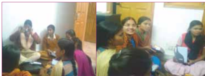
9 th March 2011: Group Discussion with Girls from the slums on: 'Adolescent Problems'

Shanti Sahyog GRC also provides information regarding Govt. Social Welfare Schemes like: widow pension yojna , old age pension yojna , ladli yojna , widow's daughter marriage yojna etc. We give detailed information regarding these schemes and provide them contact numbers and addresses of the centres from where they can get the benefit.