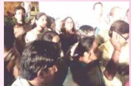
Shanti Sahyog Team protesting against corruption & supporting Anna Hazare at Jantar Mantar, New Delhi