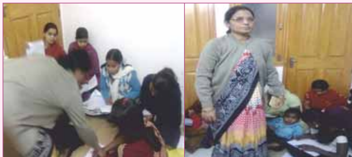
3 rd March 2011: Tailoring Exam at Shanti Sahyog – GRC Centre