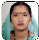
Beena Door to Door Beautician Service Income : ₹ 3,500/-