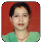
Chandni Door to Door Beautician Service Income : ₹ 3,000/-