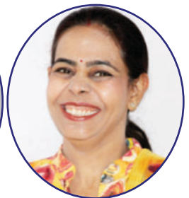
HEMA Beauty Culture Instructor TKD Village