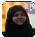
Nisha Tailoring from Home Income : ₹ 3,500/-