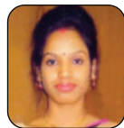
Aaloka Door to Door Beautician Service Income : ₹ 12,000/-