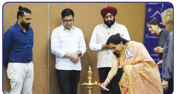
6 Oct 2018 Lighting the Lamp at Tolstoy & Gandhi Event, India International Centre, New Delhi