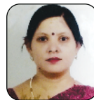
Rinki Boutique at Home Income : ₹ 5,000/-