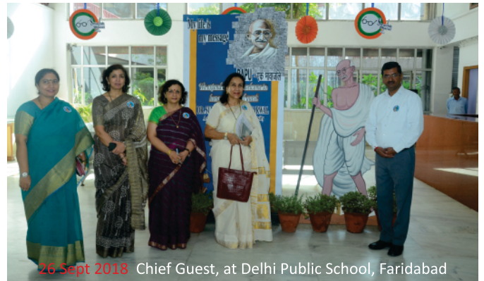
26 Sept 2018 Chief Guest, at Delhi Public School, Faridabad

Taking a leaf out of Gandhi and Tolstoy's book of life, let's resolve to stand up for our beliefs and values in the New Year!