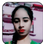
Suffi Company : Ministry of Ayush Receptionist Salary : ₹ 10,000/-