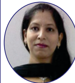
DEEPA Beauty Culture Instructor DDA Flats, KKJ Centre