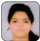
Mona Door to Door Beautician Service Income : ₹ 3,500/-