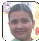
Nazreen Tailoring from Home Income : ₹ 3,500/-