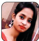
Sheetal Company : Jai Guru Ji Receptionist Salary : ₹ 7,500/-